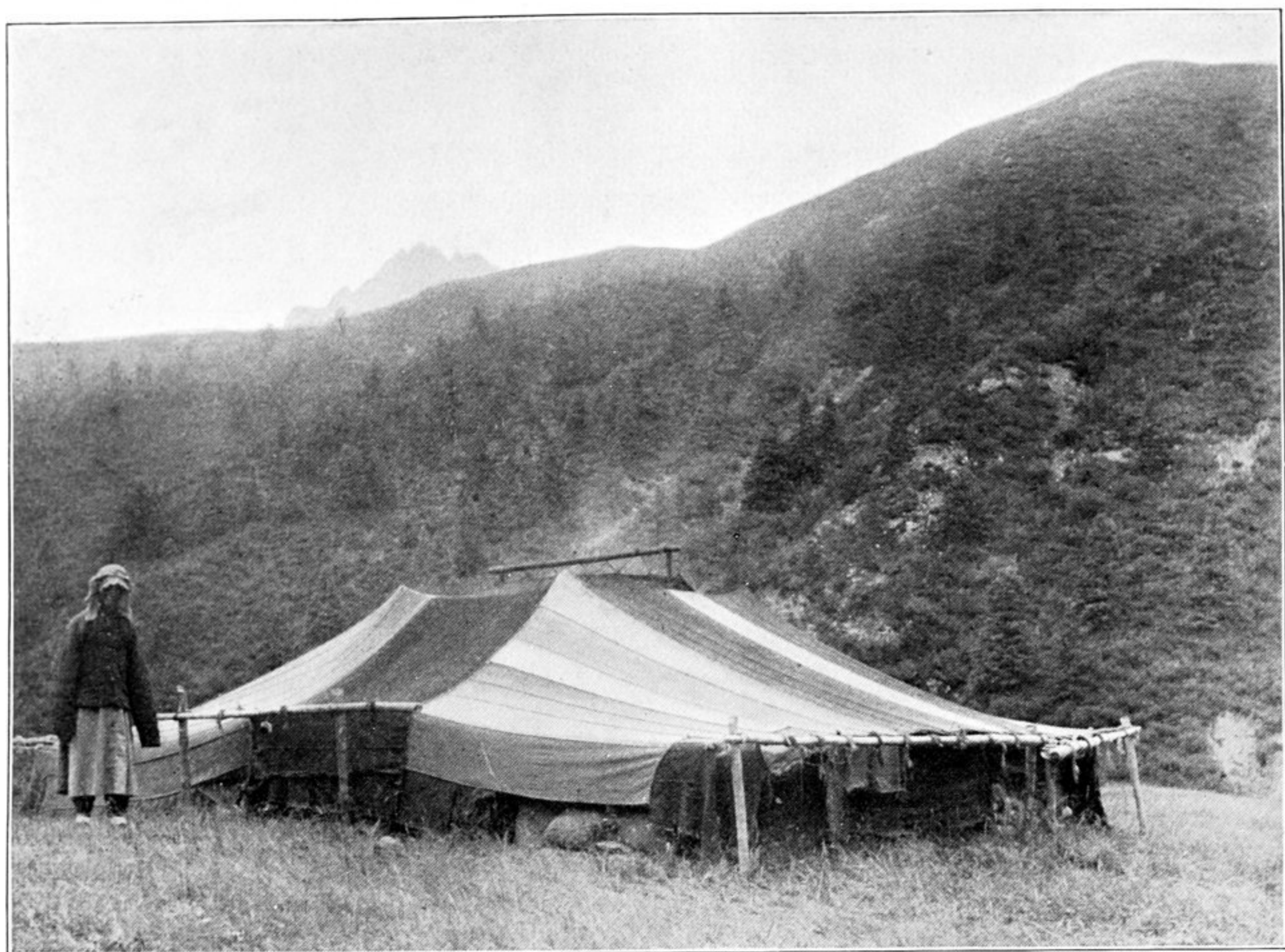
248. FIRST MONGOL CAMP MET WITH IN KHAZAN-GOL VALLEY. Chiang-ssü-yeh on left ; fir trees on slopes in background.