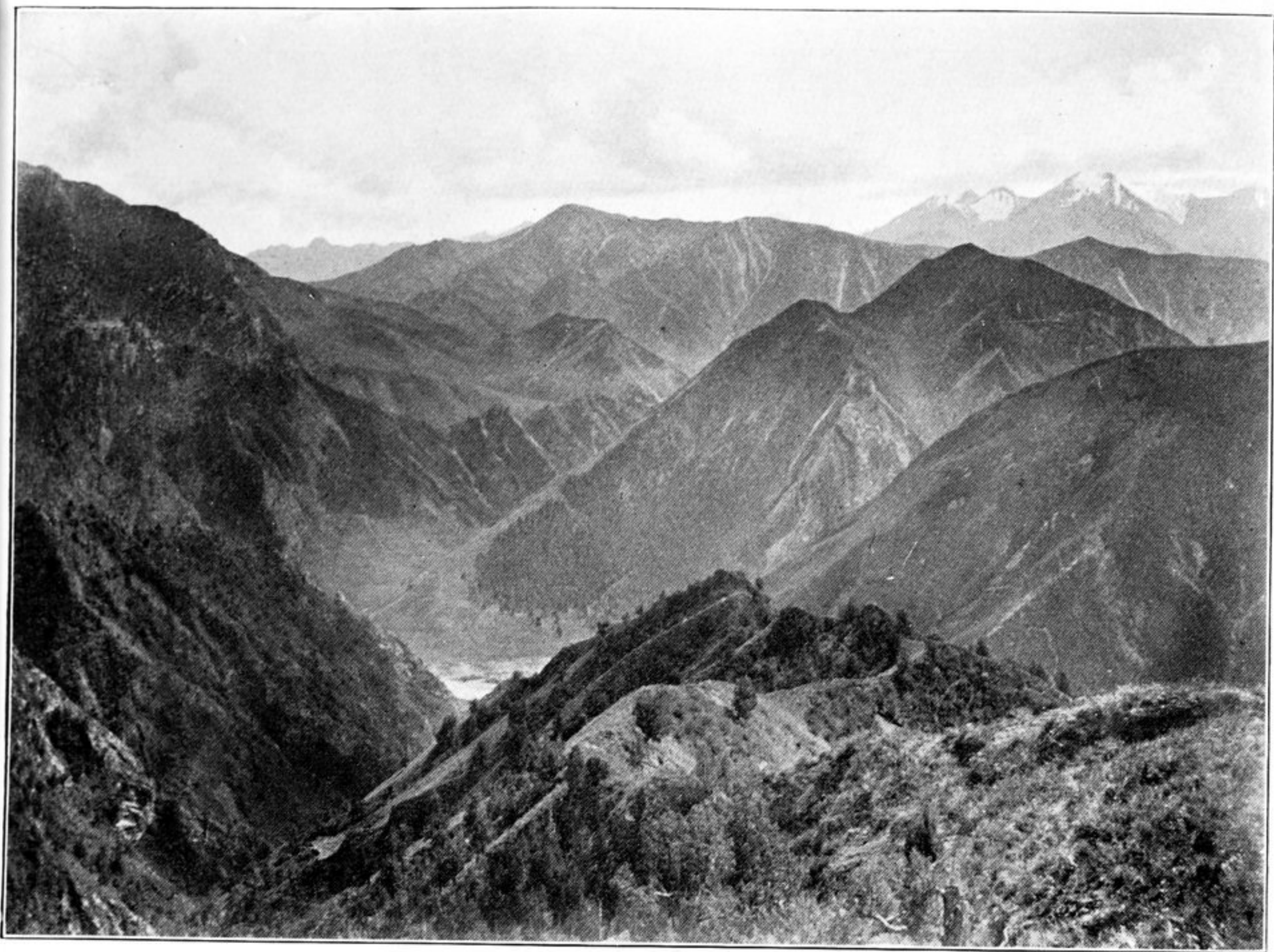
250. VIEW TO SOUTH FROM FIRST FOREST-CLAD RIDGE ABOVE KHAZAN-GOL. The Khazan-gol is just visible in valley. In distance snowy peaks of main Richthofen Range.