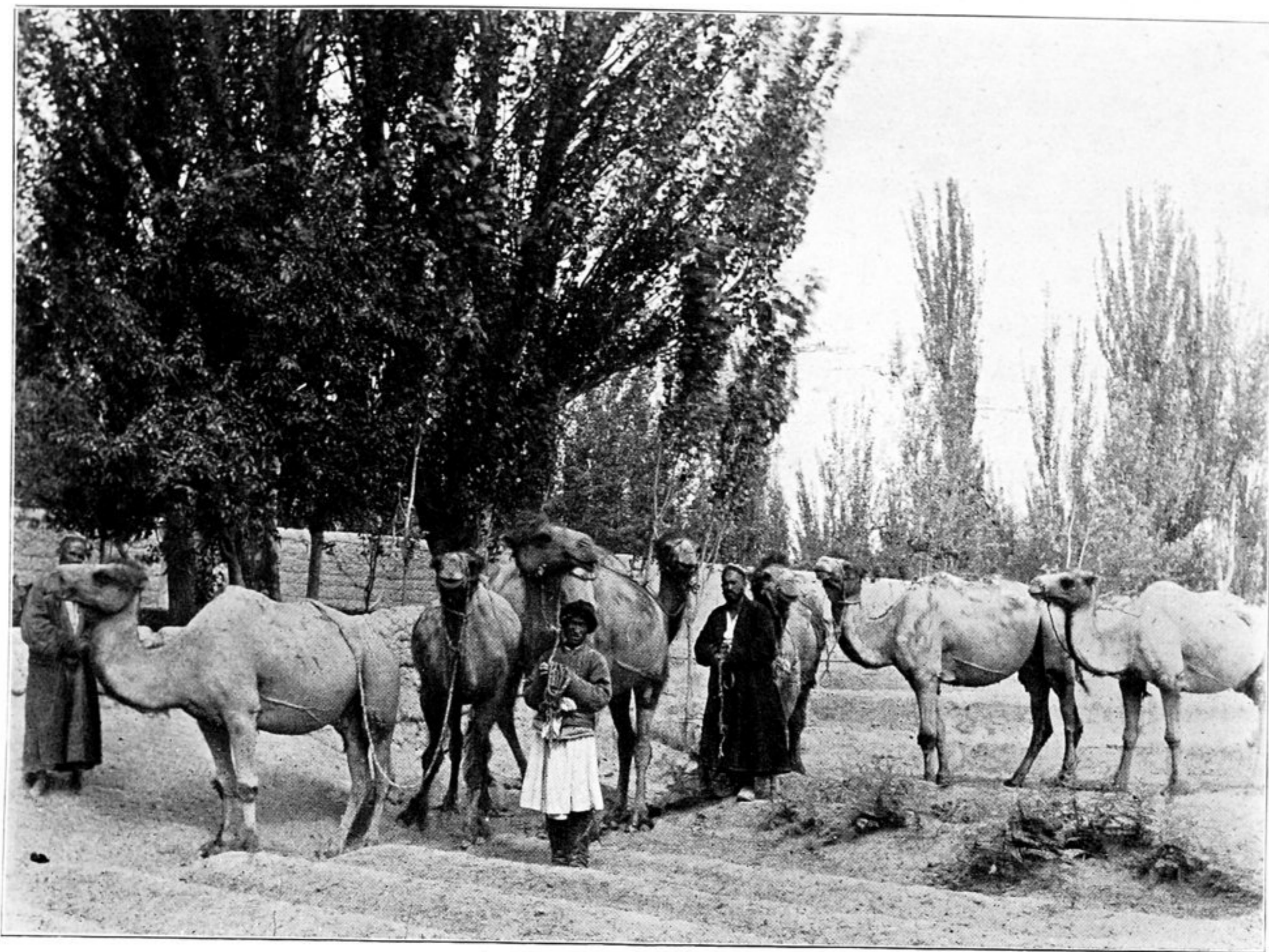
305. FAREWELL TO MY BRAVE CAMELS FROM KERIYA.