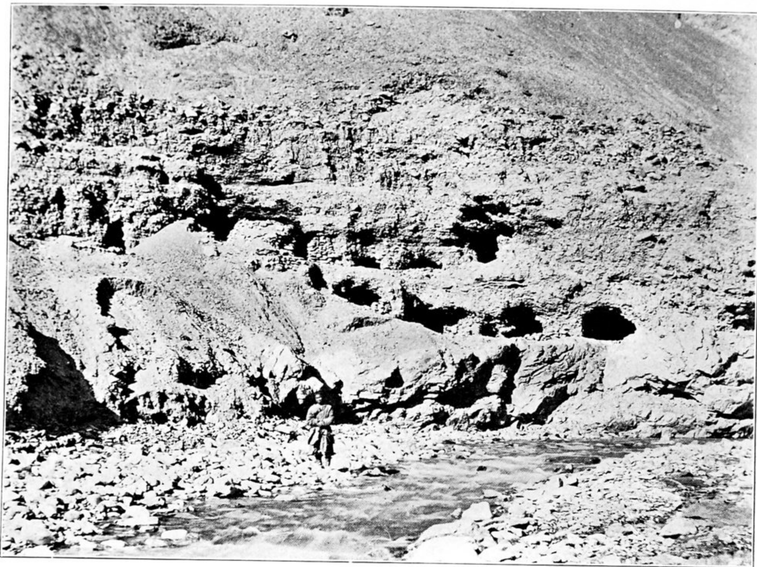
318. ABANDONED GOLD PITS IN CONGLOMERATE CLIFFS OF ZAILIK GORGE.