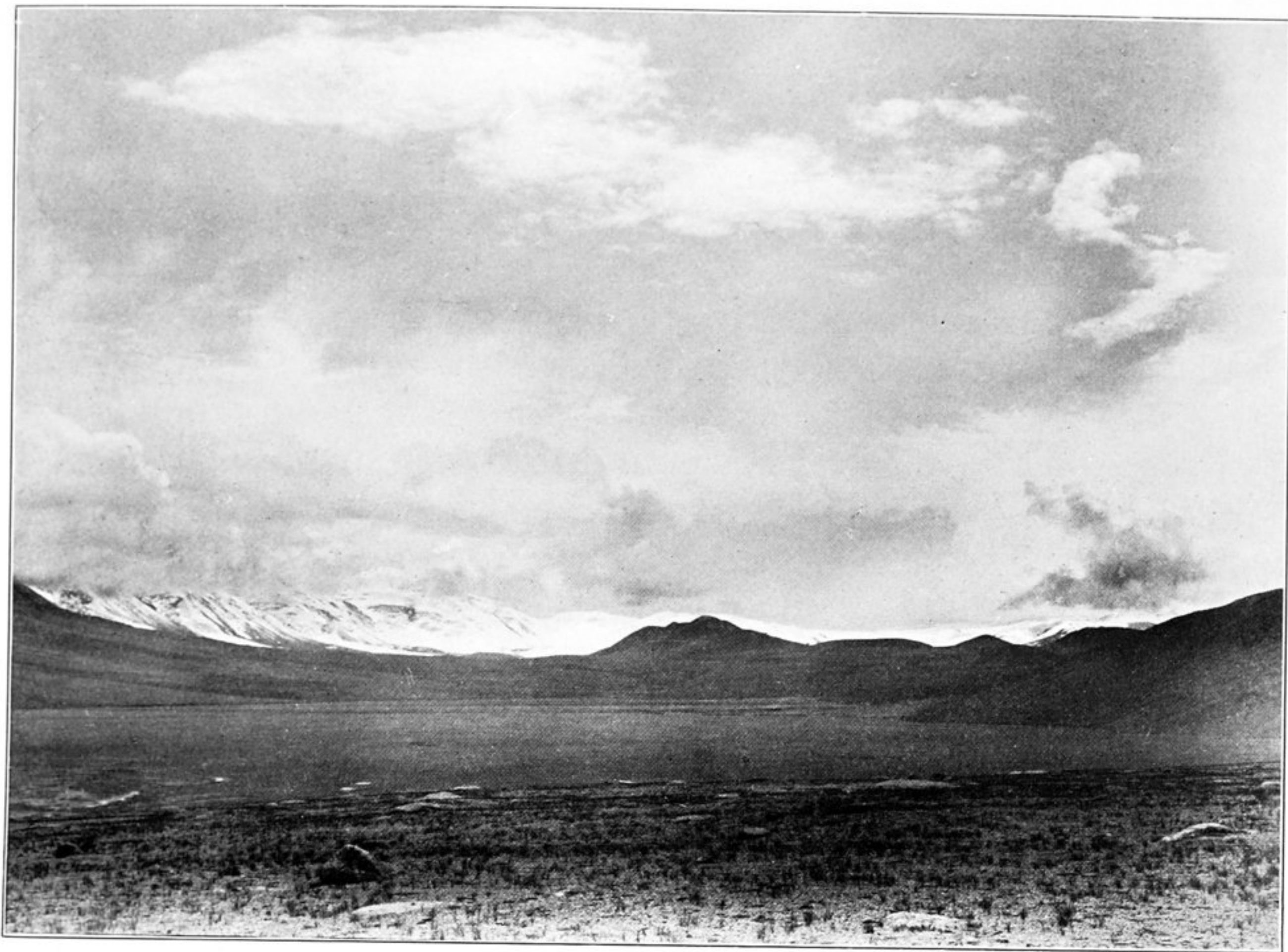
328. VIEW SOUTH TOWARDS GLACIERS OF MAIN KUN-LUN RANGE FROM HEAD-WATERS BASIN OF YURUNG-KASH.