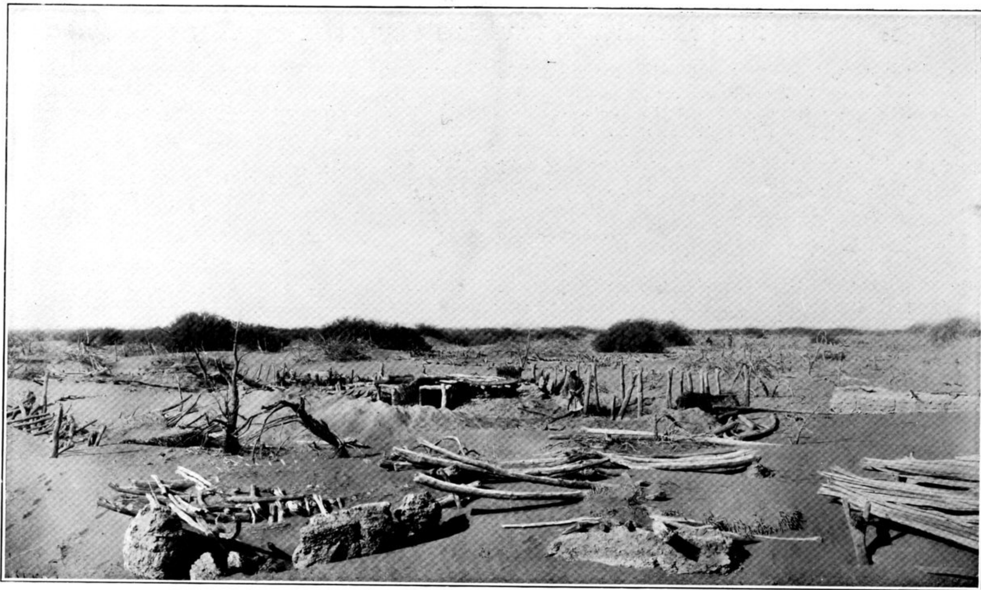
76. RUINED DWELLINGS WITHIN CIRCUMVALLATION OF BILÉL-KONGHAN, NEAR GATE, PARTIALLY CLEARED.