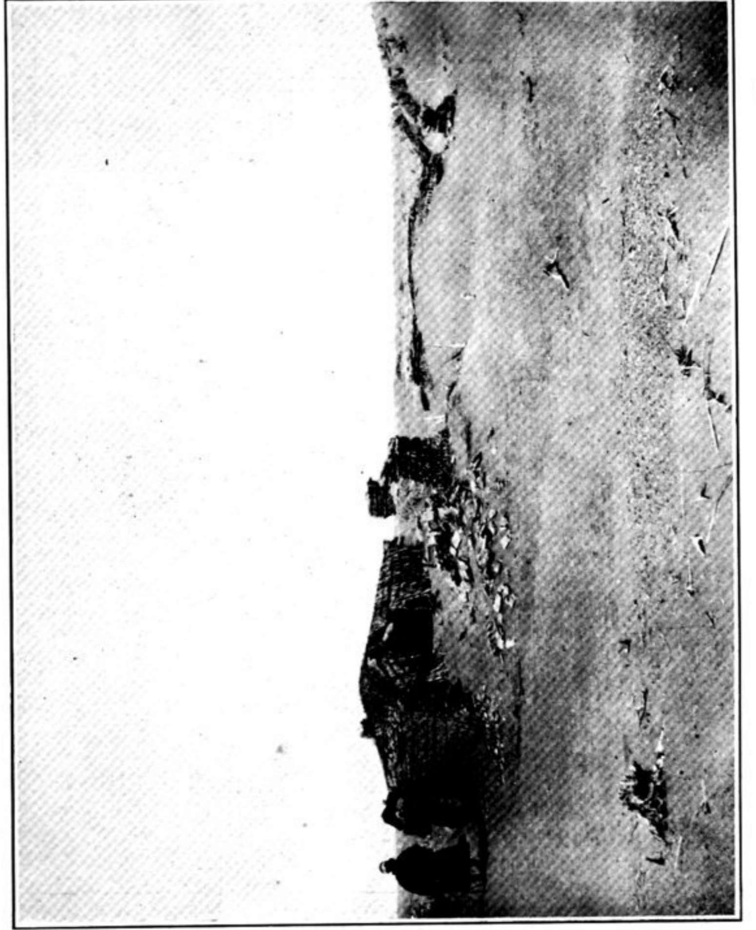
164. REMAINS OF FARM AND FENCED ARBOUR, ABANDONED TO DESERT, AT KUAN-TSOU, N. OF NAN-HU.