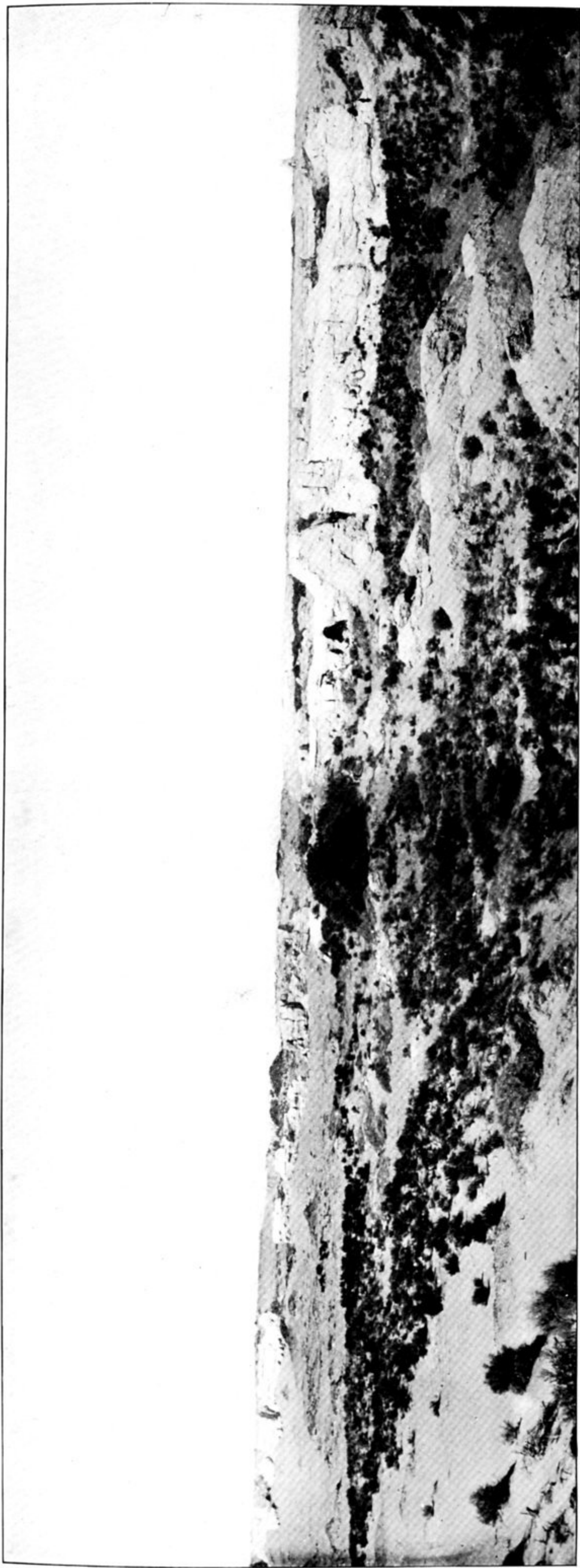
185. RUINED TOWN OF SO-YANG-CH'ENG, SEEN FROM NORTH-EAST, WITH INNER EAST WALL IN FOREGROUND AND TOWER OF NORTH-WEST CORNER BASTION IN DISTANCE ON RIGHT.