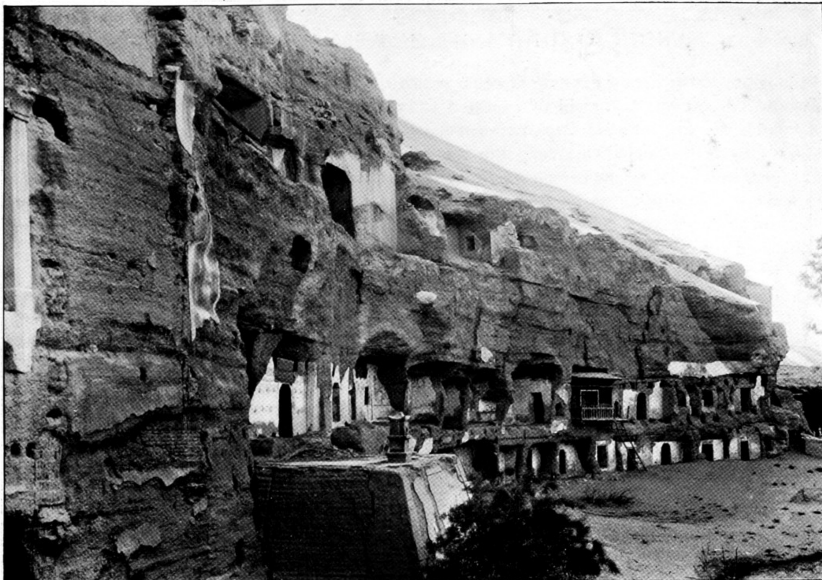
199. ROWS OF SMALL CAVE SHRINES ADJOINING CAVE CH. XII NORTHWARD, CH' IEN-FO-TUNG, TUN-HUANG. On extreme left, portion of middle porch, giving light to cave of colossal seated Buddha