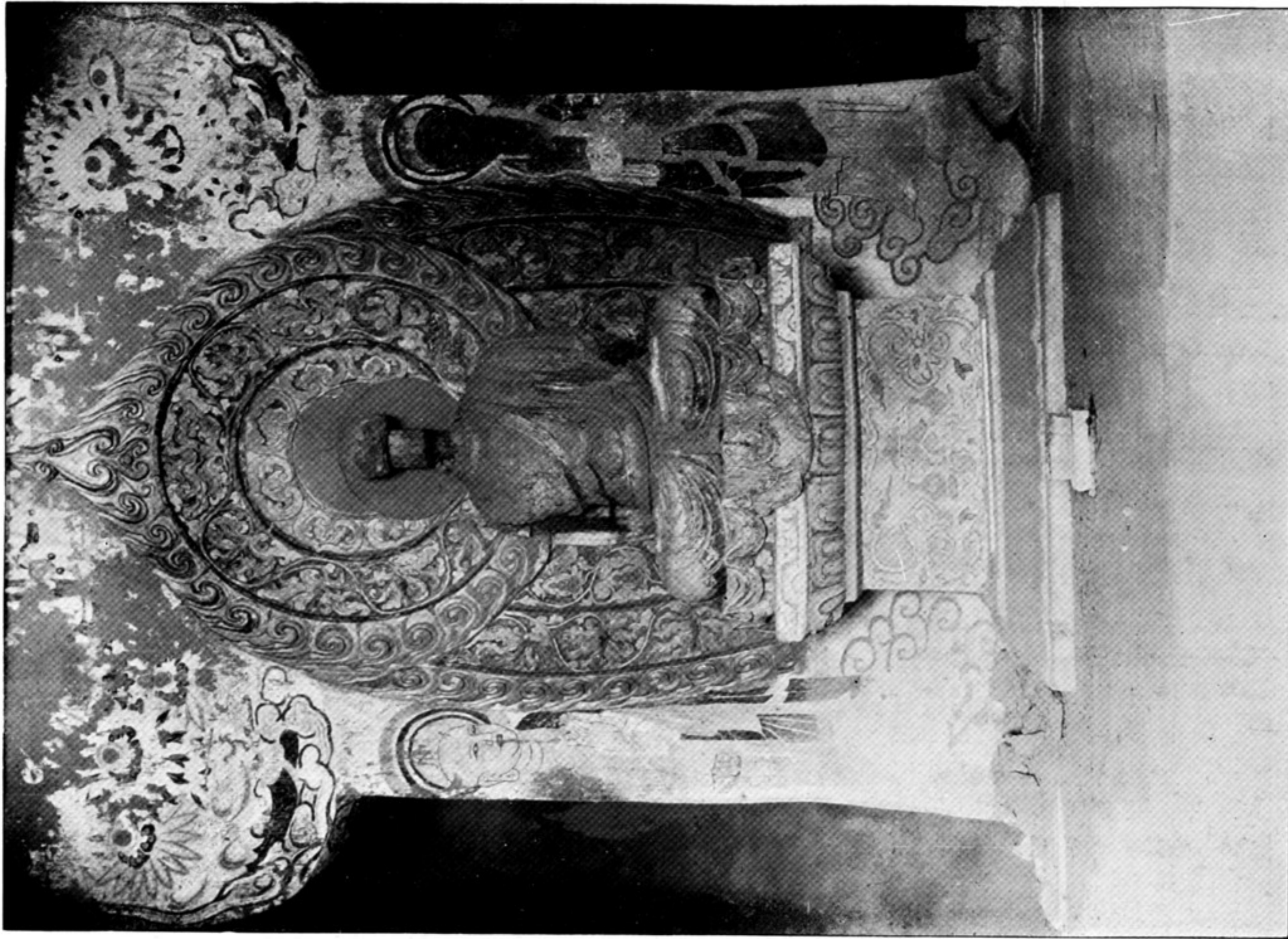
201. STUCCO IMAGE OF COLOSSAL SEATED BUDDHA, WITH PAINTED HALO AND VESICA IN RELIEVO AND TEMPERA PAINTINGS ON ROCK-CARVED SCREEN BEHIND, IN CELLA OF CAVE CH. II, CH'EN-FO-TUNG.