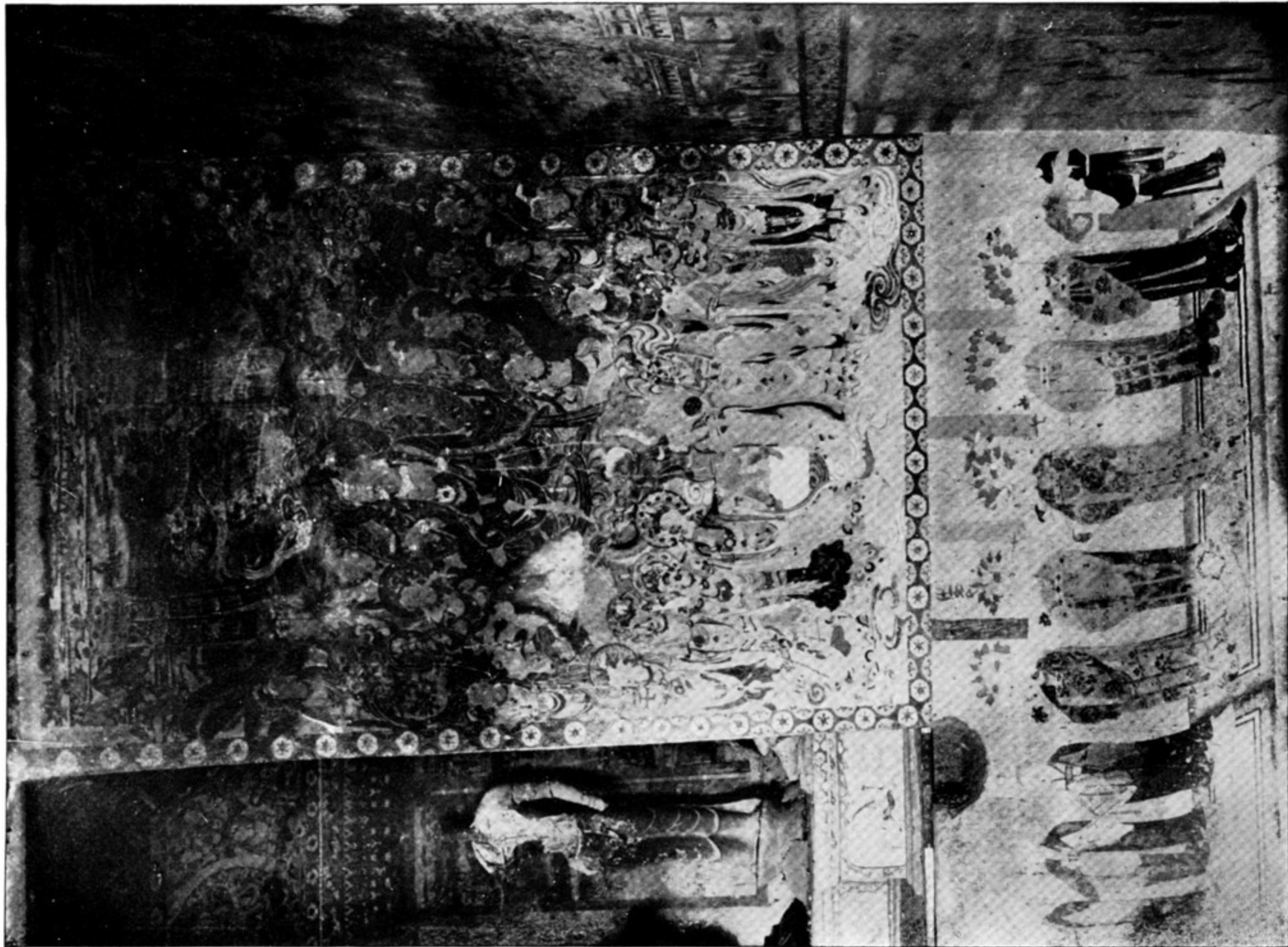
230. TEMPERA PAINTINGS IN NORTH-WEST CORNER OF CELLA IN CAVE CH. XII, CH'EN-FO-TUNG.