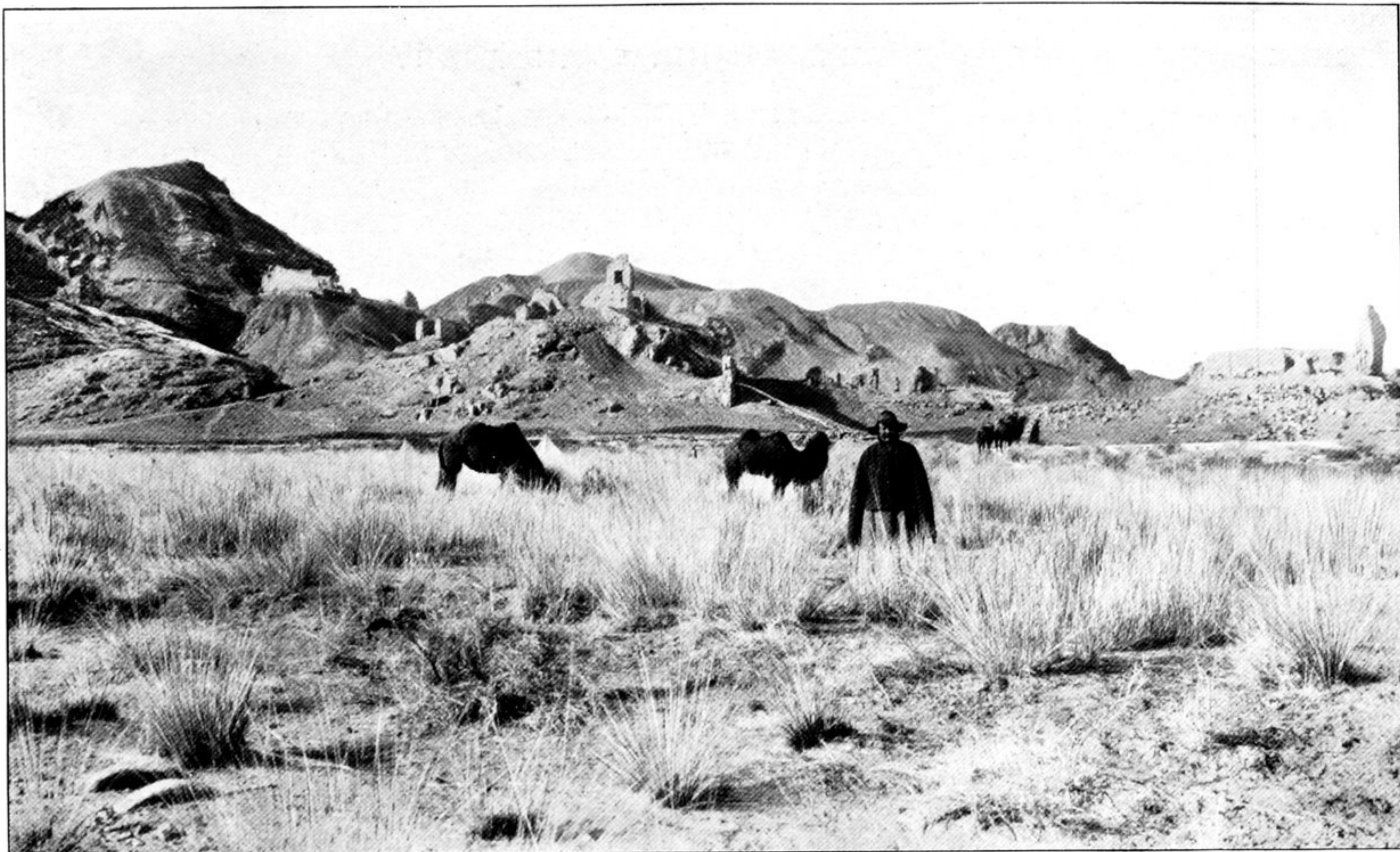
297. RUINED SHRINES OF KHŌRA SITE, SEEN FROM SOUTH-EAST.