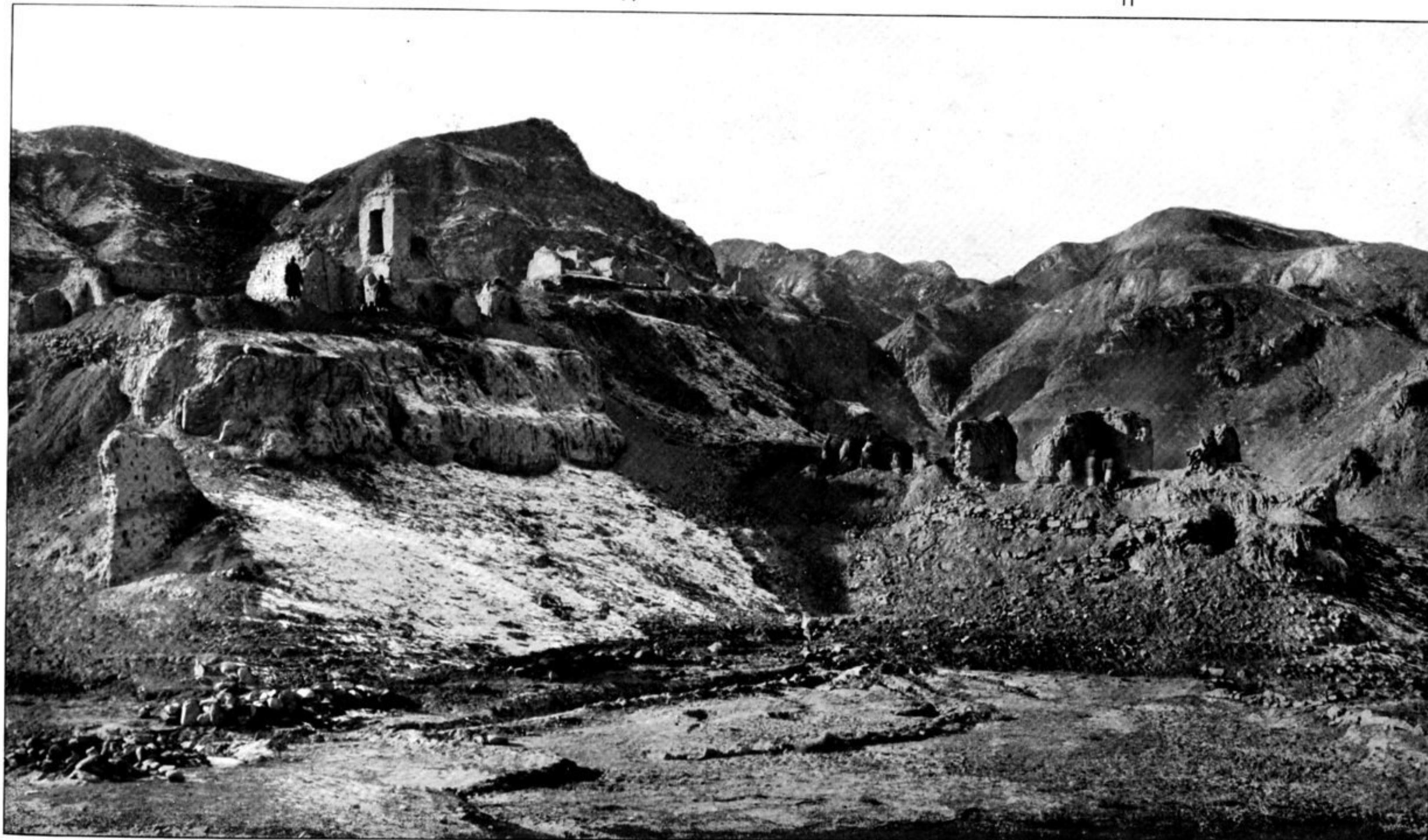
300. RUINED BUDDHIST SHRINES, KHORA, SEEN FROM EAST. RUINS OF GROUPS I, II IN FOREGROUND.