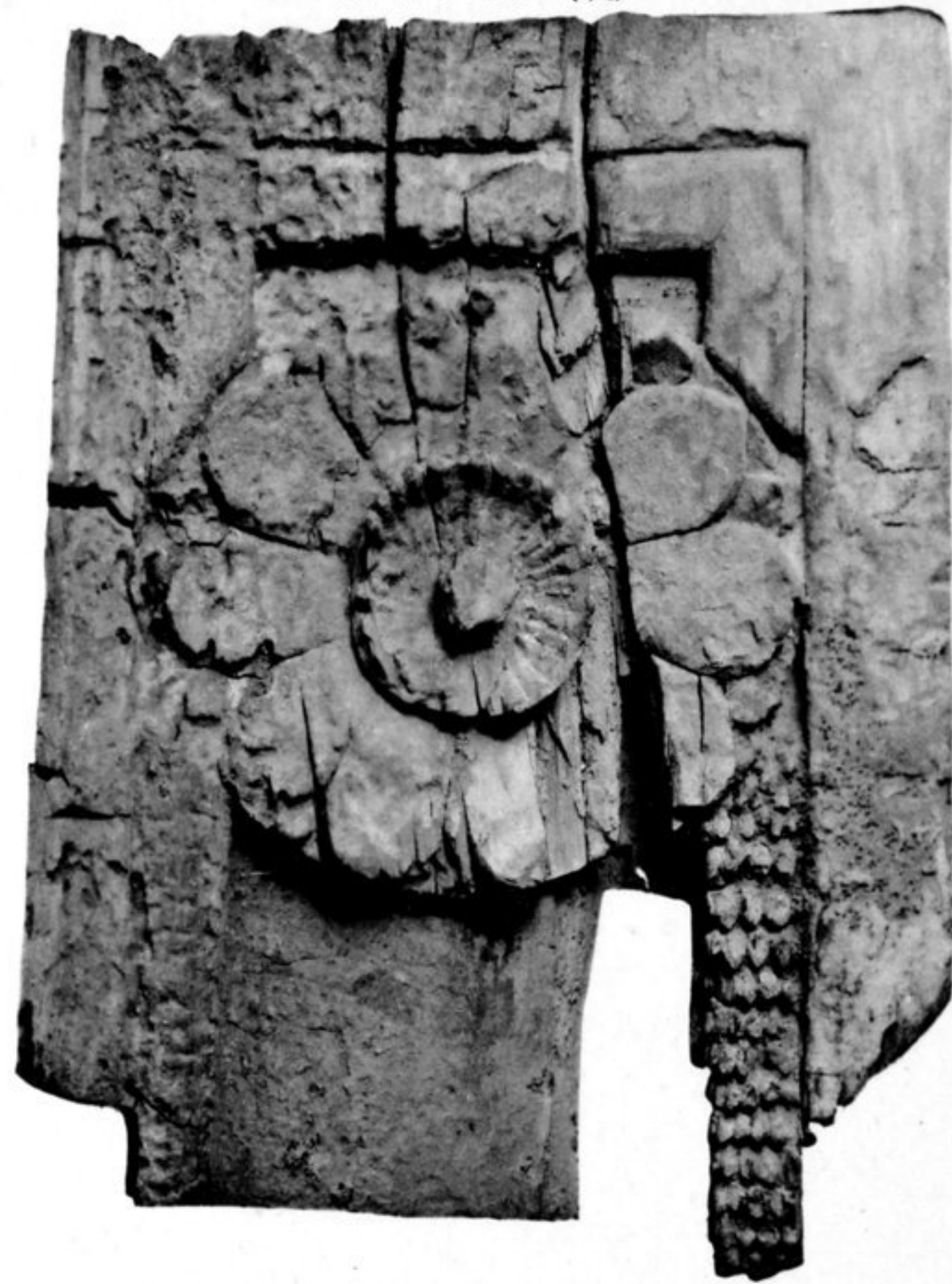
M. V. 0012. (1/4)