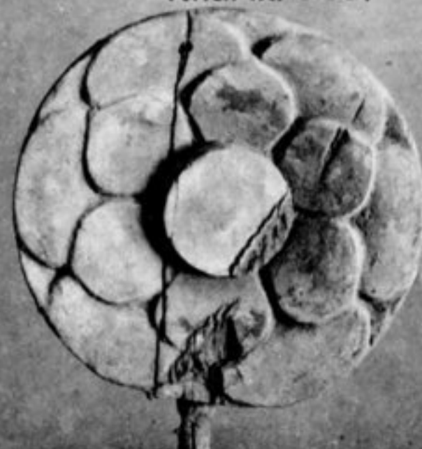
Kha. ix. 009.