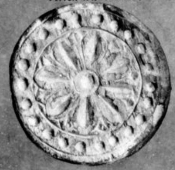
Kha. ix. 0023.