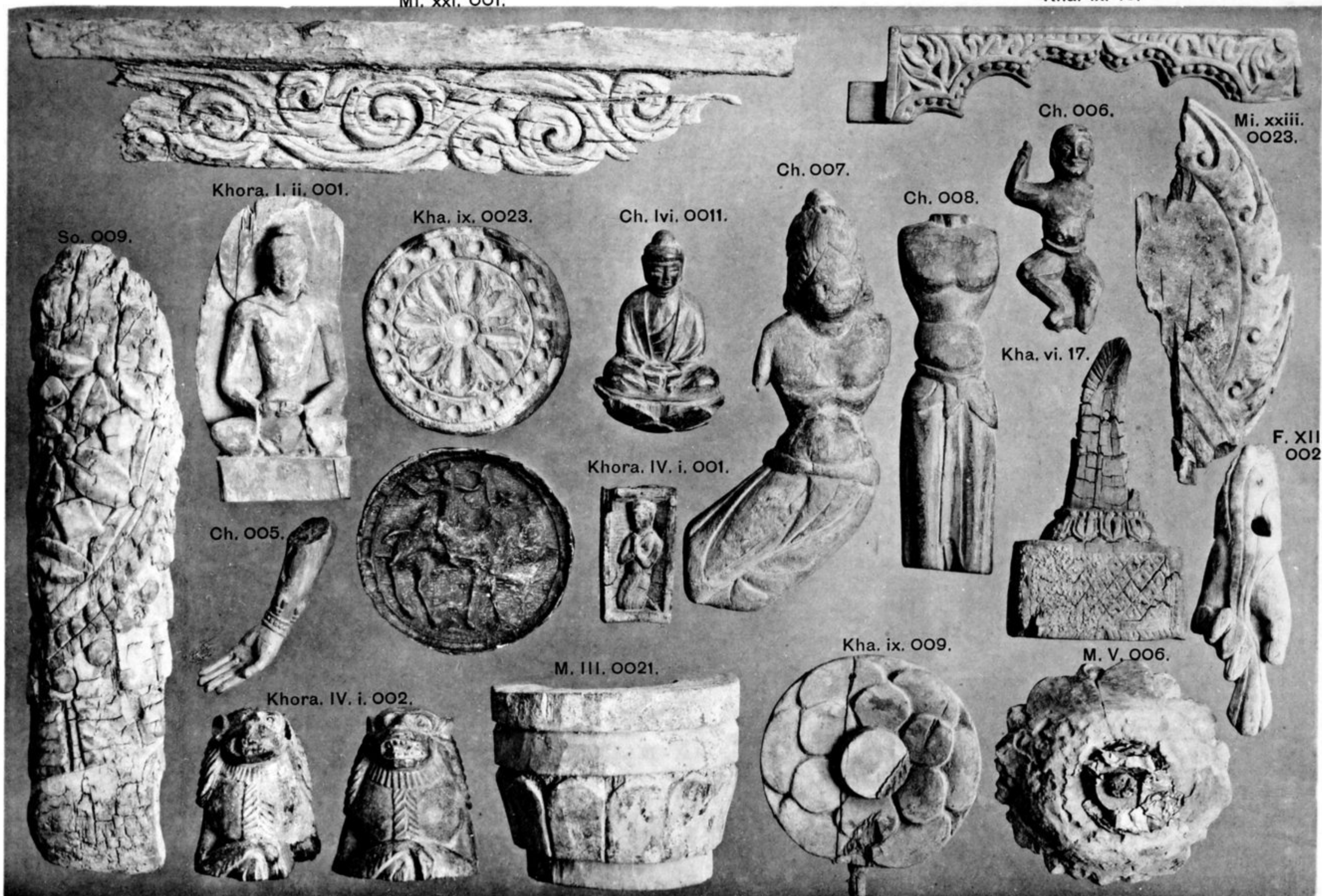
Khora. I. ii. 001.