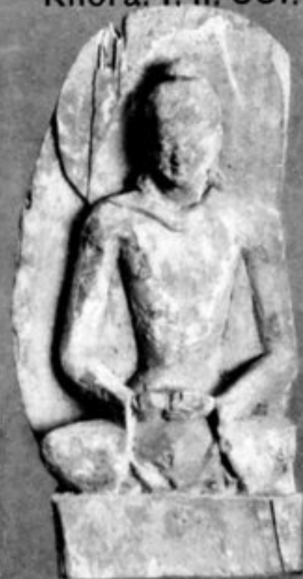
Khora. I. ii. 001.