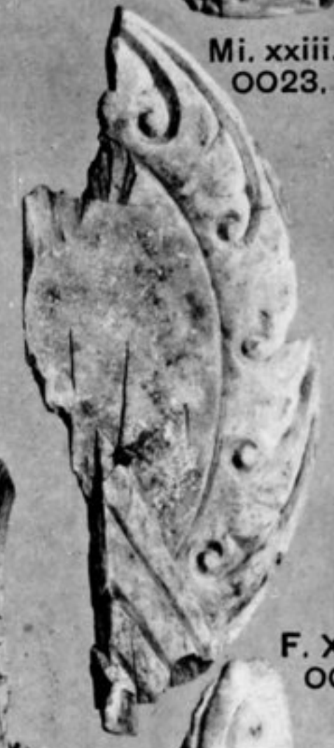
Mi. xxiii. 0023.