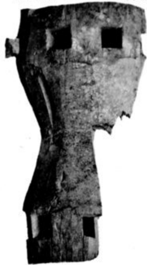
M. III. 0024. (1/4)