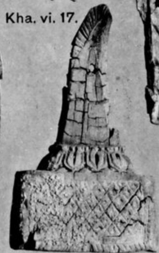
Kha. vi. 17.