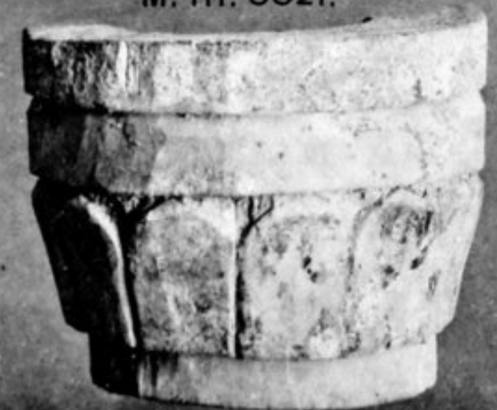
M. III. 0021.