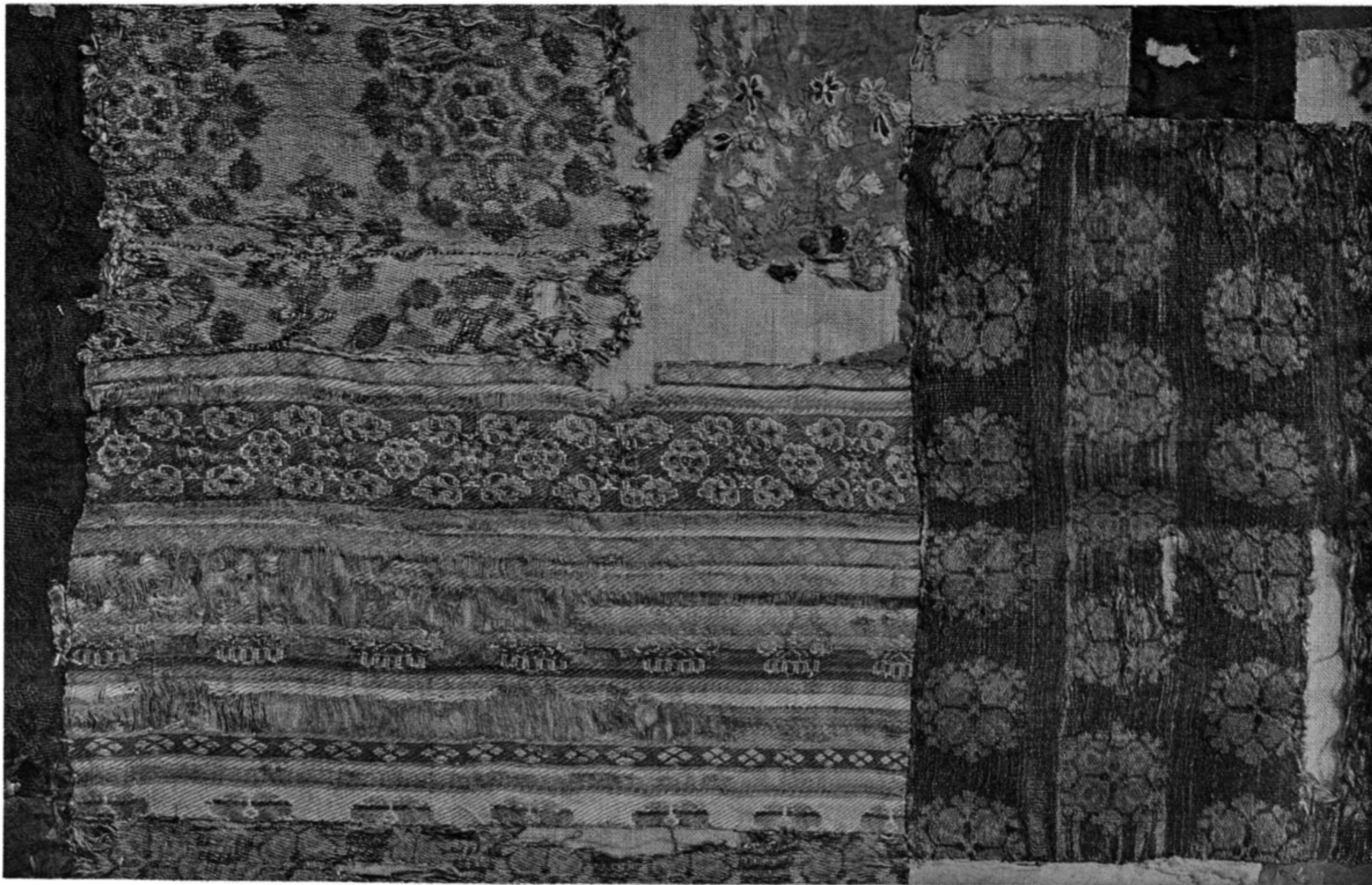
PORTIONS OF PATCHWORK (Ch. Iv. 0028), SHOWING SPECIMENS OF EMBROIDERIES AND FIGURED SILKS, FROM 'THOUSAND BUDDHAS', TUN-HUANG.

(See Chap. XXIV. sec. i, ii; Chap. XXV. sec. ii; cf. also Key to Pl. CVIII.)