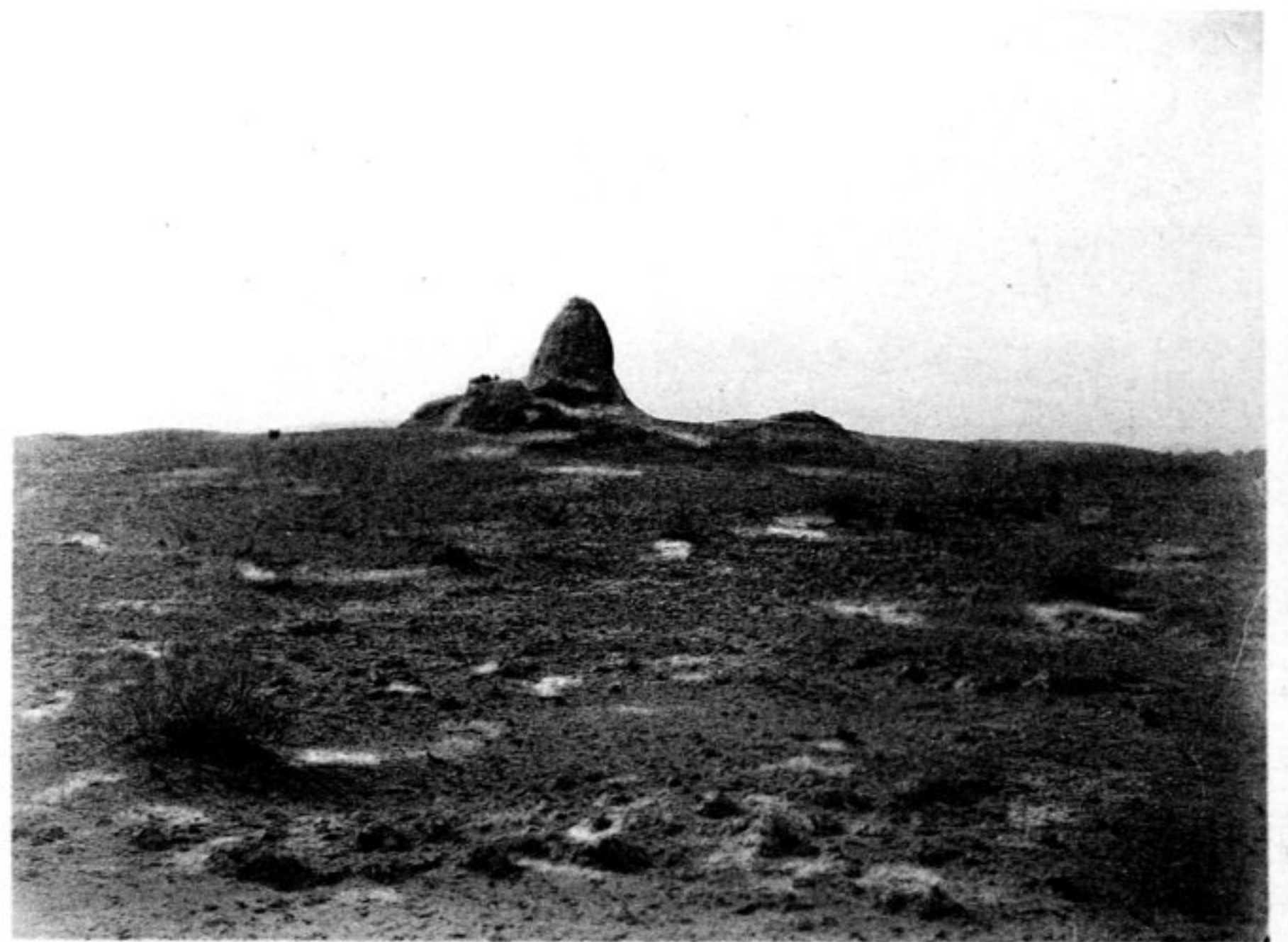
Stûpa de Che-ts'ao-tseu.