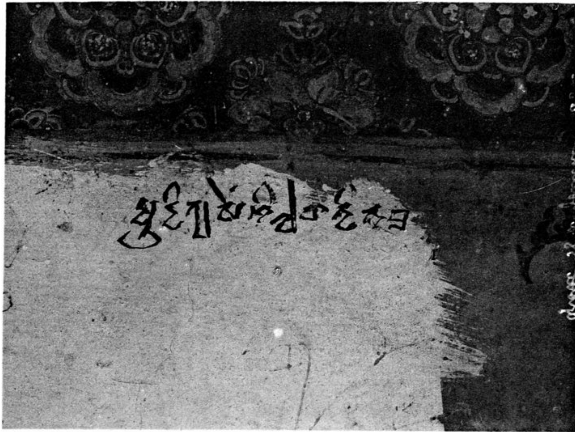
TOUEN-HOUANG. — Grotte 38. Inscription brahmi.