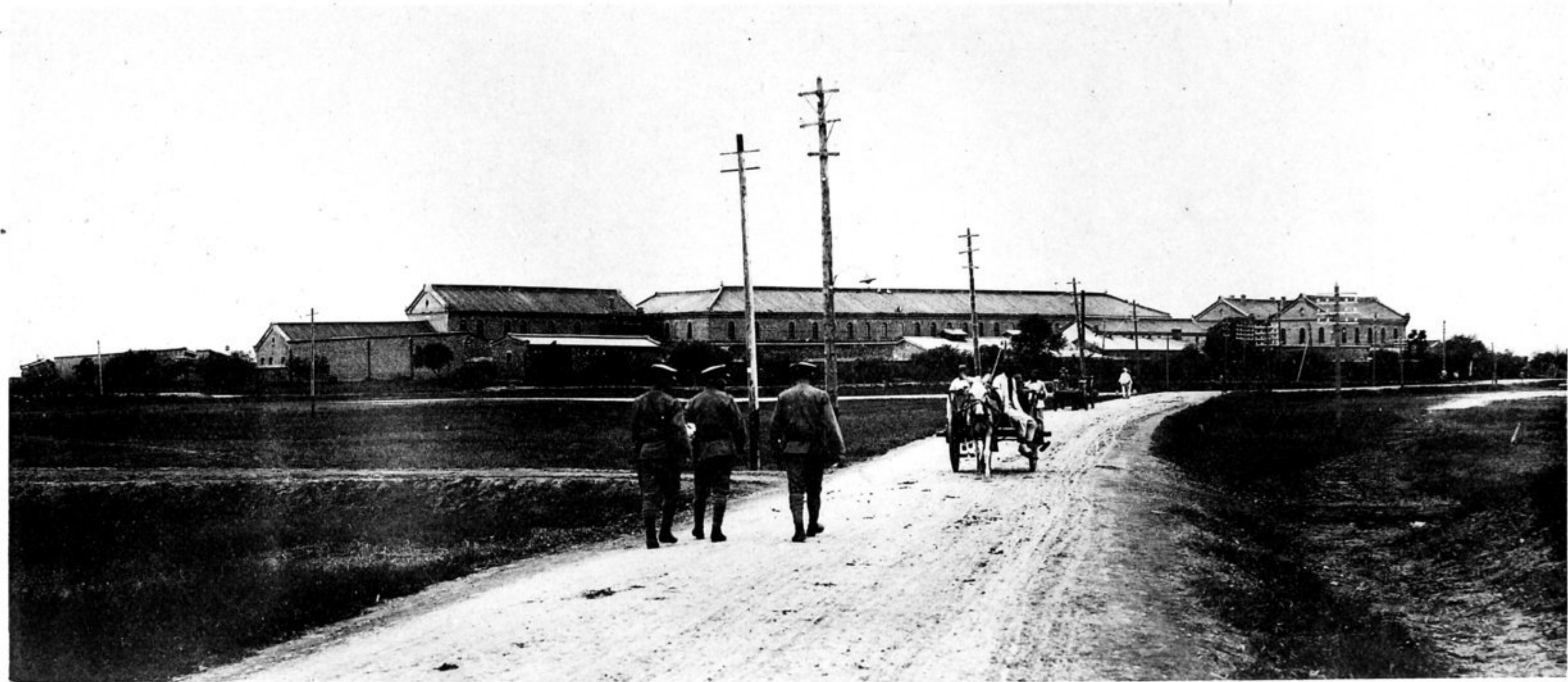
景全ノ營兵軍屯駐清北本日大 (津天) (Tien Tsin) Japanese Barracks.