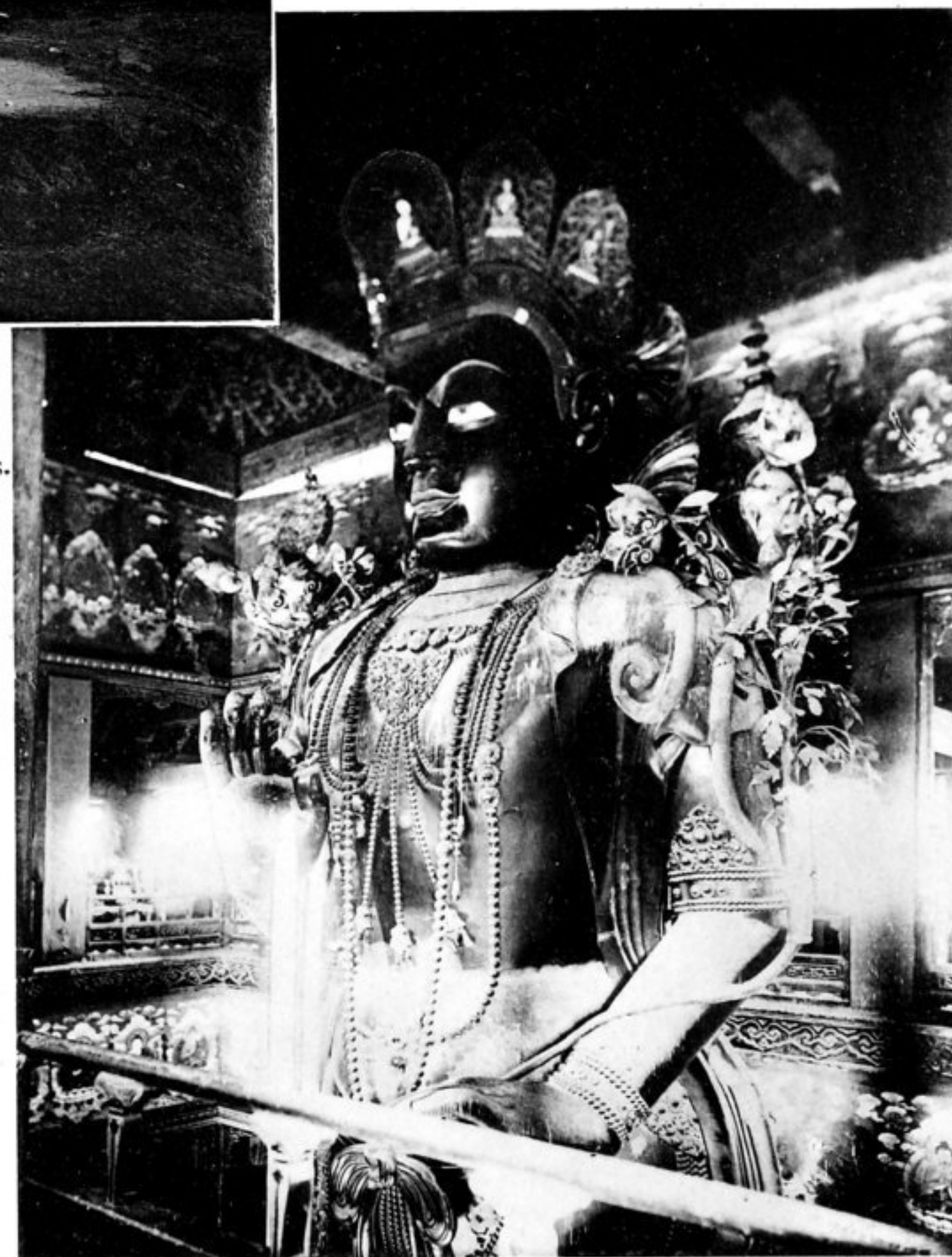
術美ト飾装ノ像佛式古蒙及藏西テシニ緻巧刻彫 佛大ノ宮和雍 シベフ舞見ヲ朝喇喇此バセ欲トシラ知ヲ班一ノ (Peking) The great Buddha in Lama Temple.