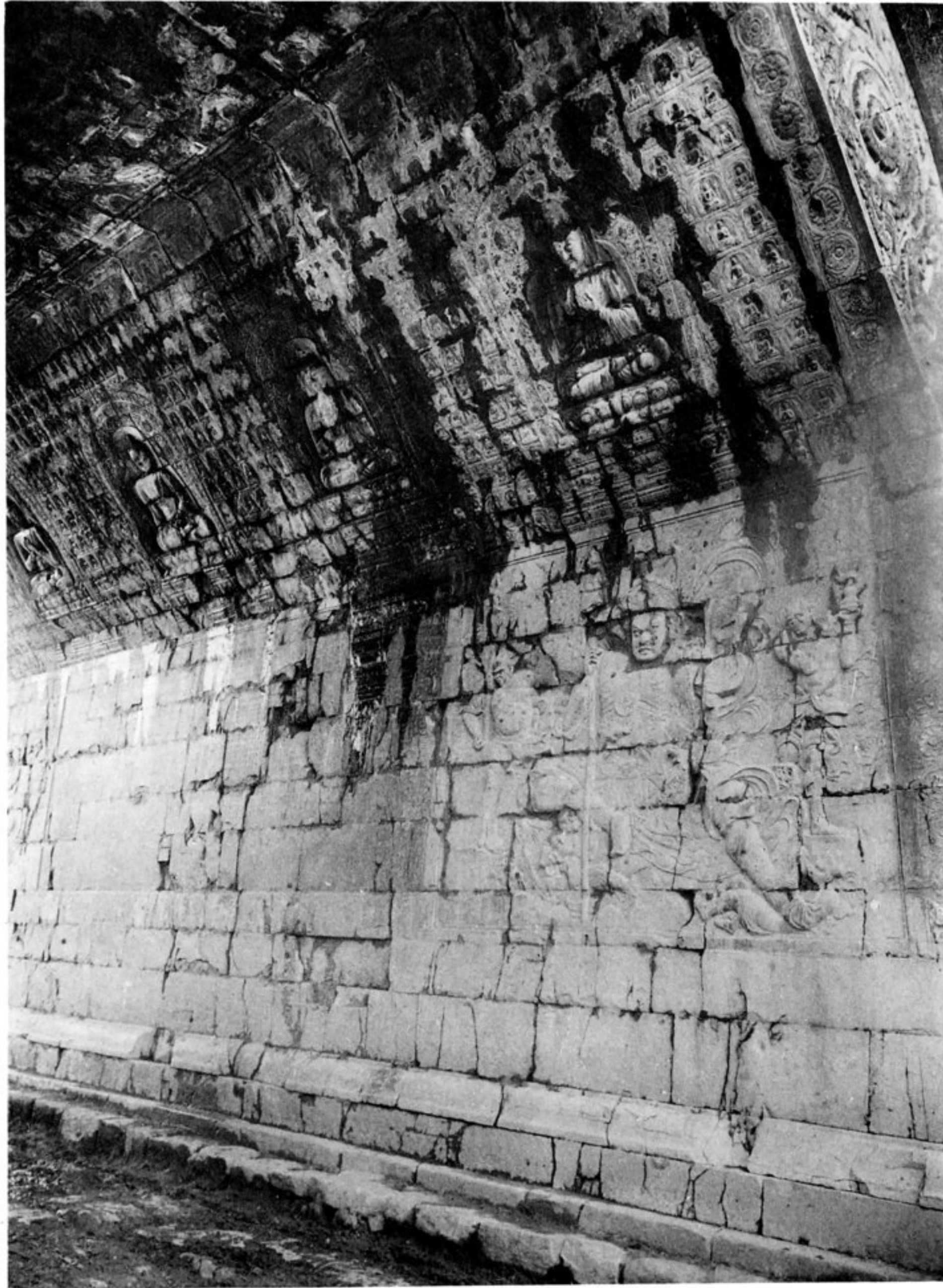
壁内ノ關庸居 Inner view of Chui Yun Kwan.