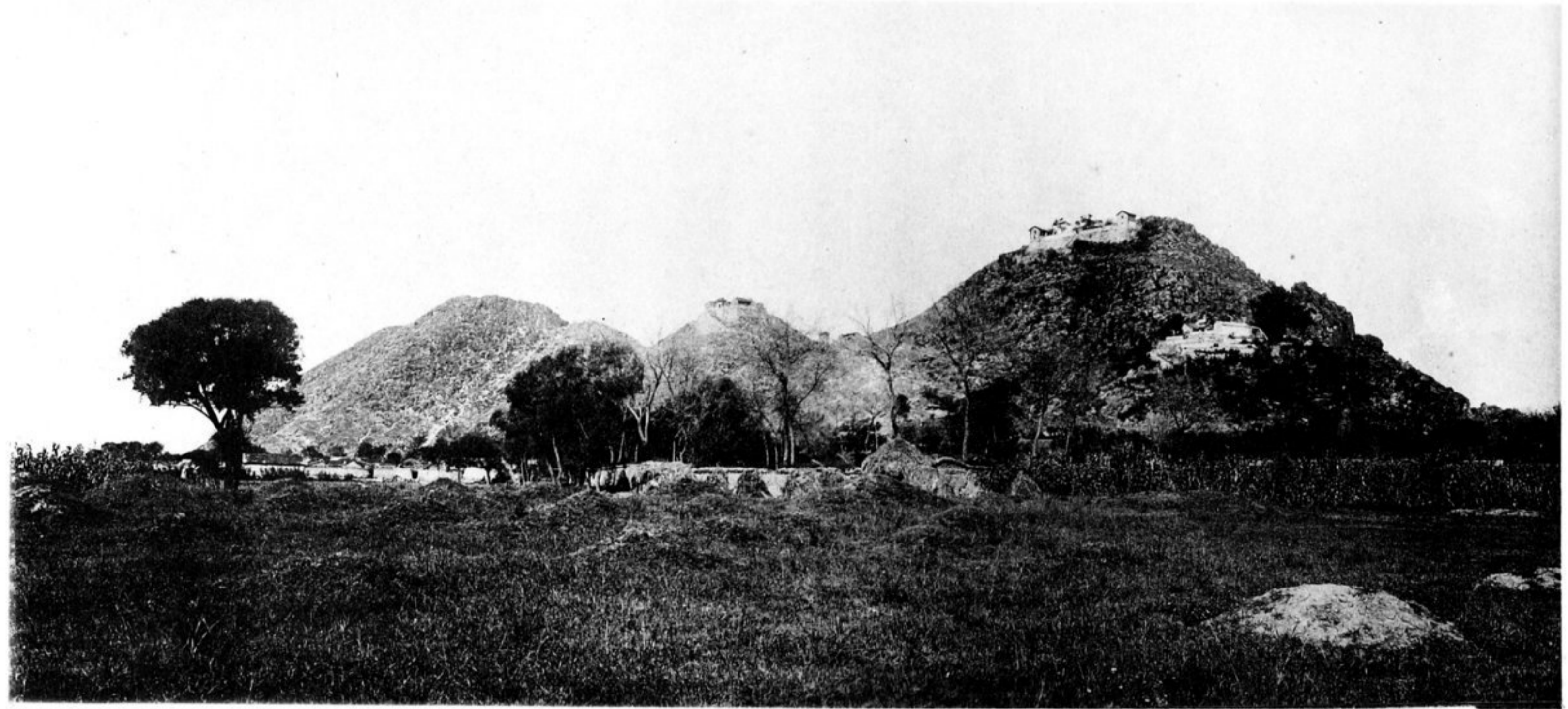
湯山 湯山ノ全景ナリヨリナリ温泉水各所ニ湧出ス The whole view of Tang Shang. There are many hot spring wells.