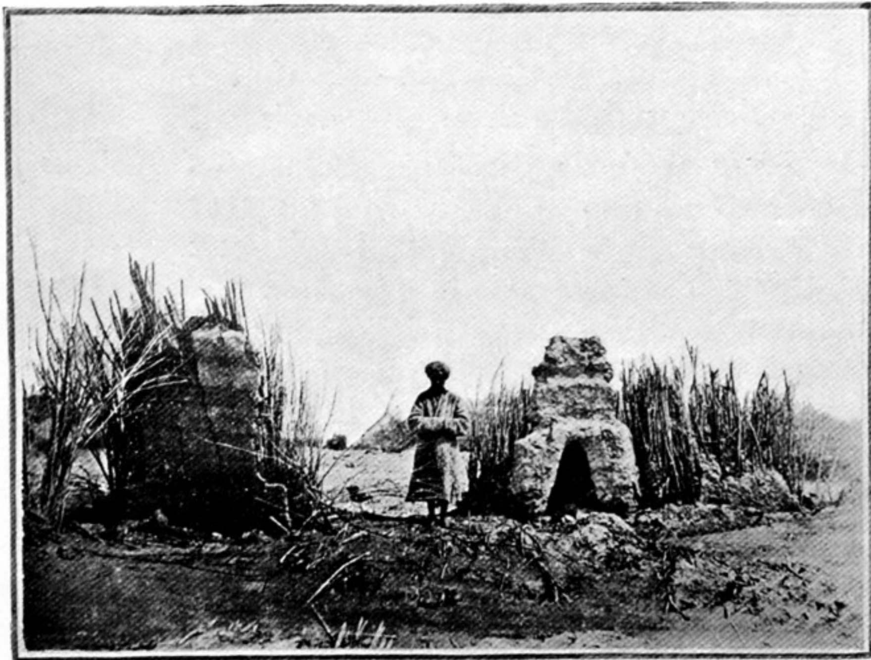
REMAINS OF DESERTED MODERN DWELLING, AT KOBZAGIRAM-SHAH, DOMOKO.