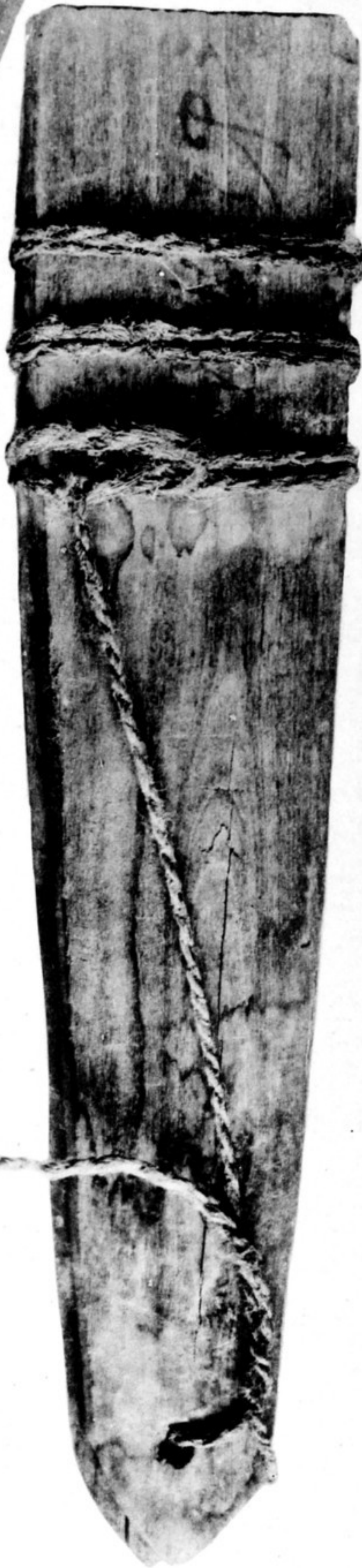
KHAROṢṬHĪ DOCUMENTS ON WEDGE TABLETS, FROM NIYA SITE.

(See Chap. XI. sec. i, ii, iv, vii, viii.)