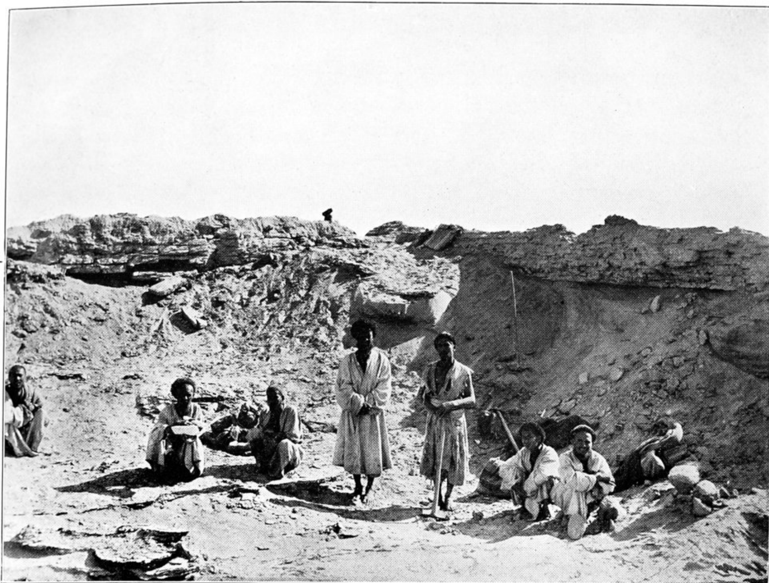
74. ERODED REMAINS OF TEMPLE RUIN AT KINE-TOKMAK.

Arrows mark original ground level and lowest masonry course of south-east and south-west walls.