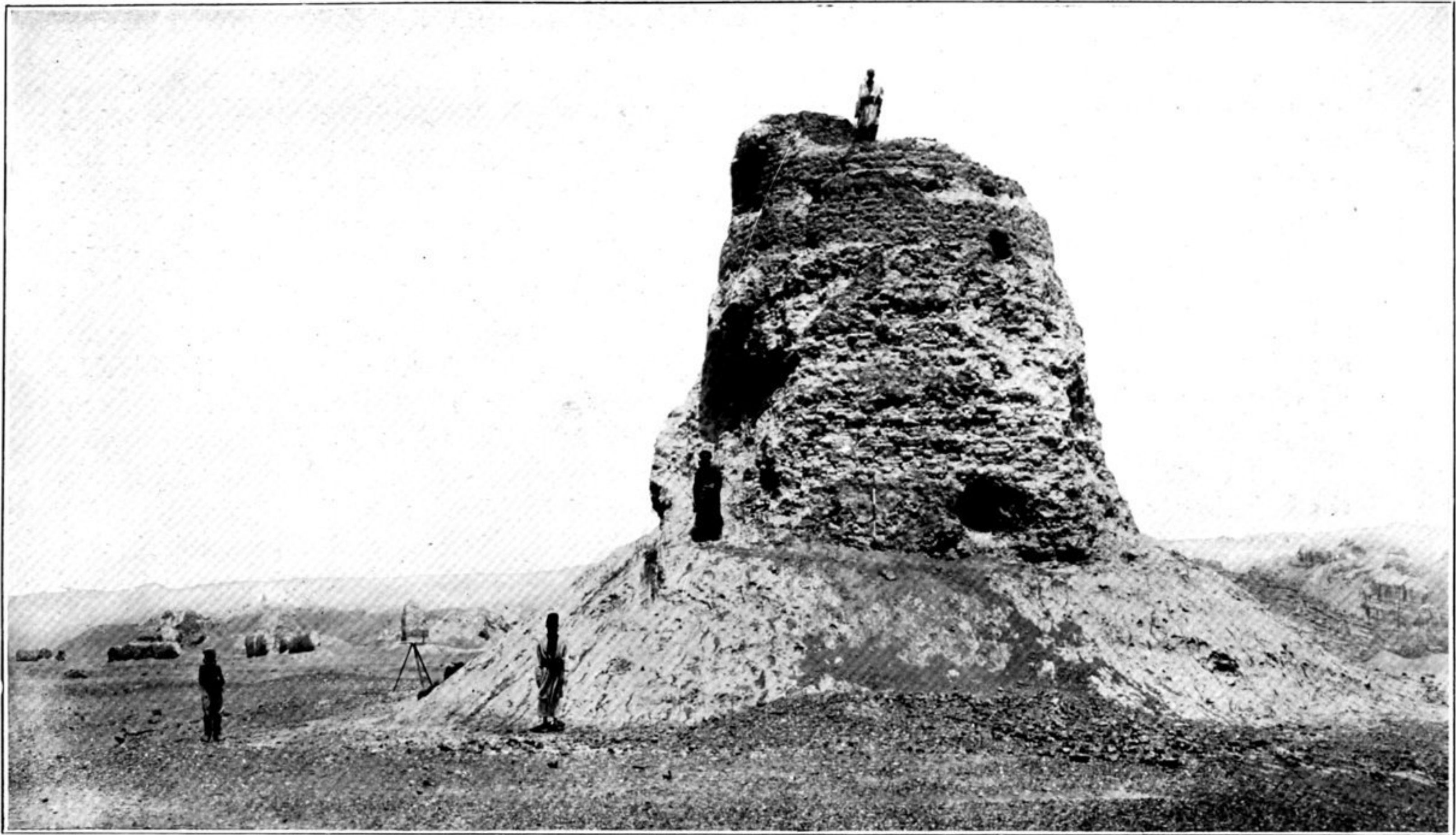
33. RUINED STŪPA AT SITE OF KHĀKĀNNING-SHAHRI, NORTH OF KASHGAR.