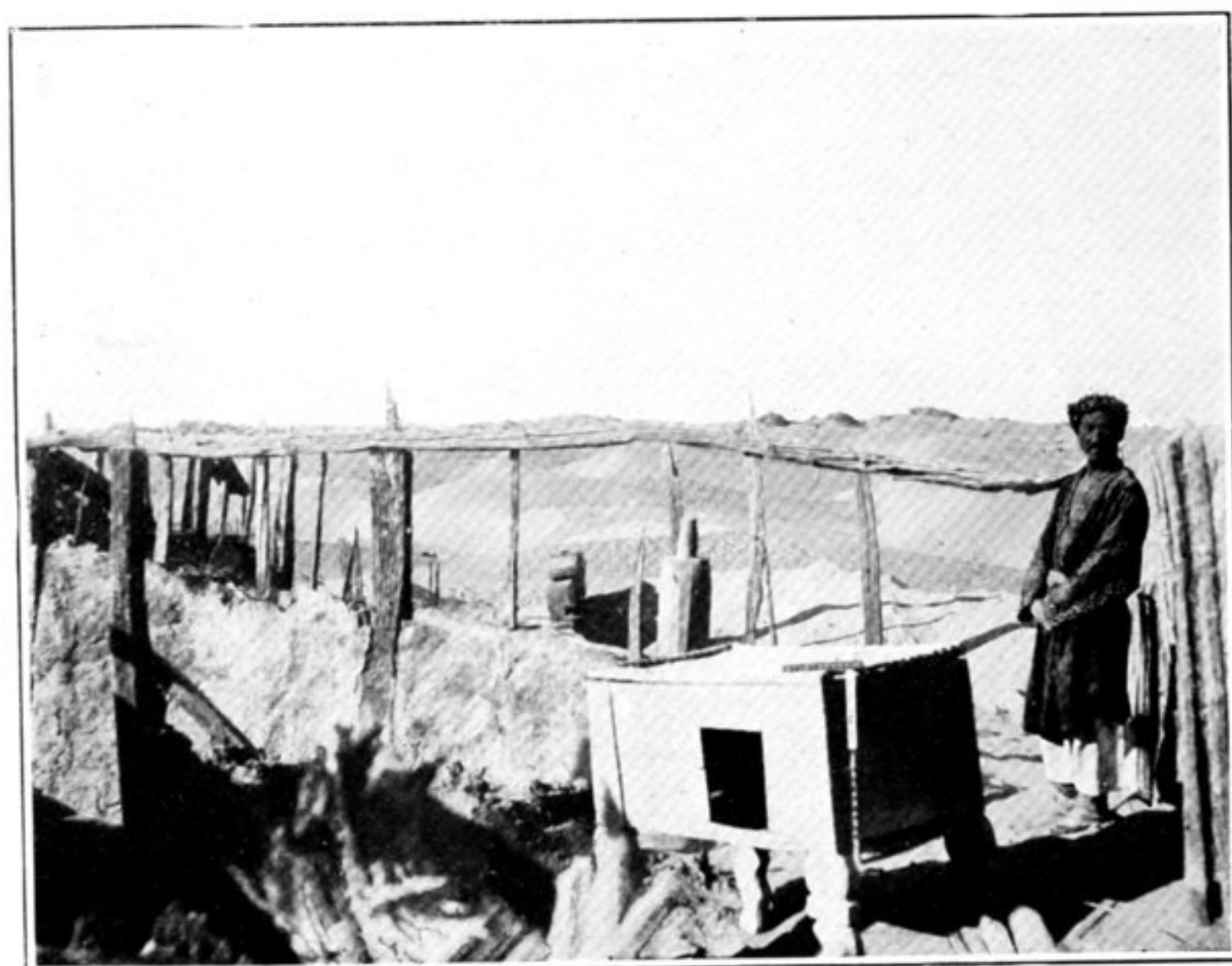
57. ANCIENT CUPBOARD EXCAVATED IN ROOM viii OF RUINED HOUSE, N. XXVI.