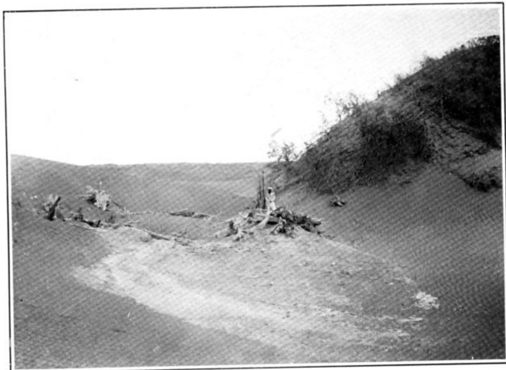
55. REMAINS OF ANCIENT TANK TO SOUTH OF RUIN N. XXII, NIYA SITE.