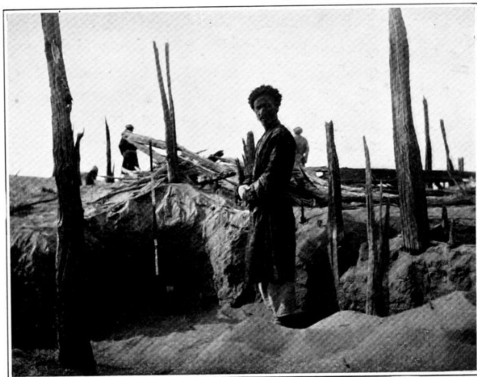
58. ROOM viii OF RUINED RESIDENCE N. XXIV, IN COURSE OF EXCAVATION.

The measuring-rod marks batch of Kharoṣṭhi tablets emerging from sand.