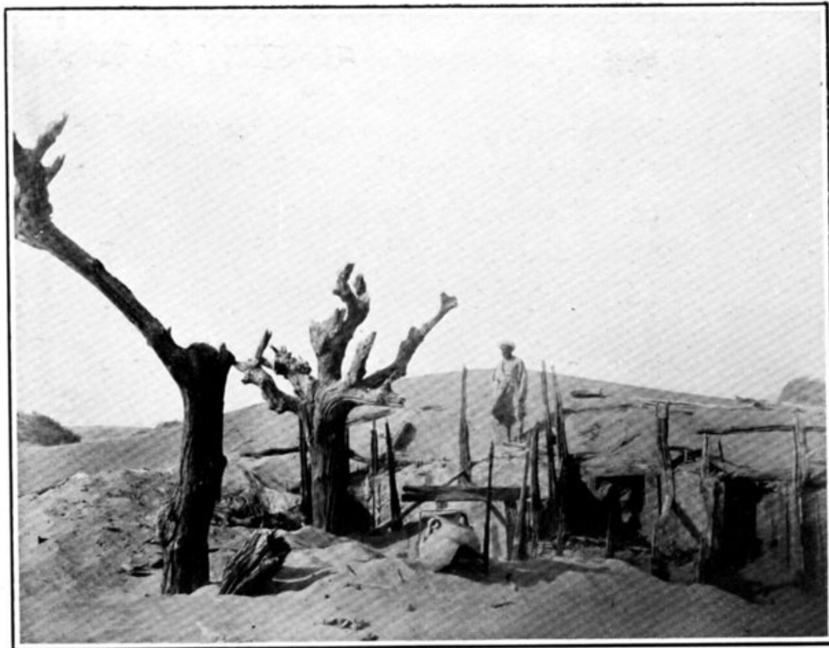
54. ROOMS iii, iv OF RUIN N. XX, NIYA SITE, SEEN FROM EAST, AFTER EXCAVATION.