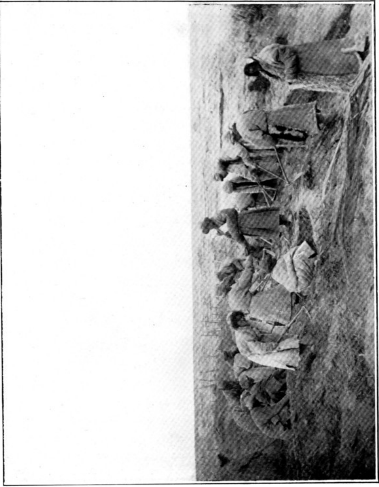
100. REFUSE HEAPS OF L. A. VI II, LOU-LAN STATION, IN COURSE OF EXCAVATION.